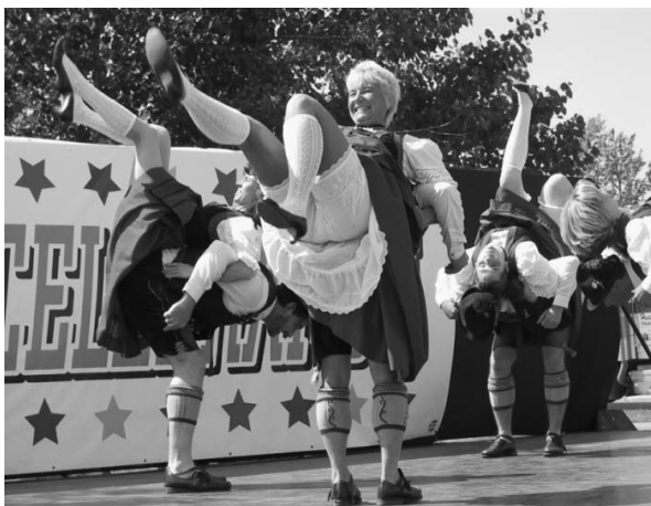
BLOOMERS... our girls like to show them off...