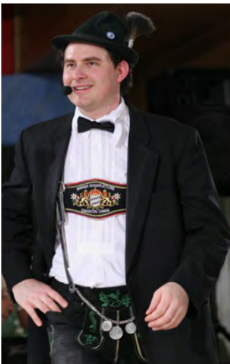
Bond... Lederbond... James Lederbond

James Lederbond , International Man of Mystery, is sent by his boss BMW of the Ba-